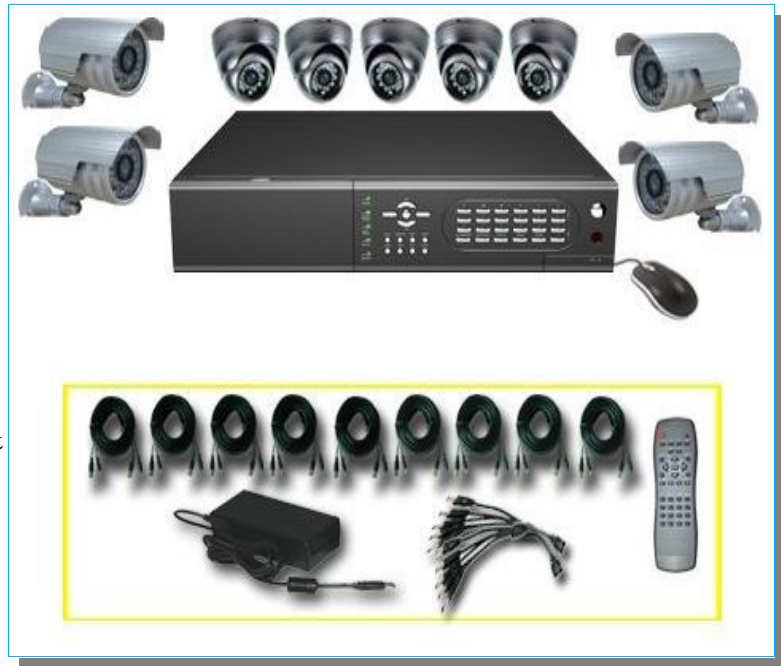
Pictured: Kit KT_3G_9CH