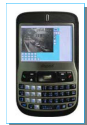
3G image on phone